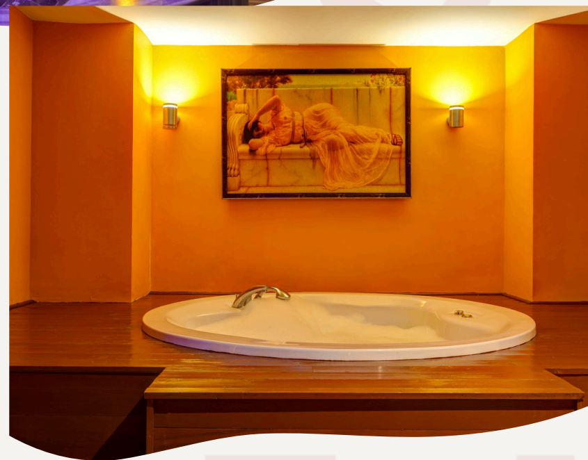
SPA & SAUNA